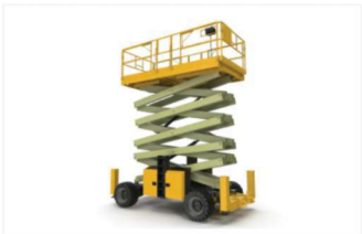
Rough Terrain Scissor Lift