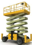
Rough Terrain Scissor Lift